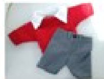
4pairs of free Uniform per Child