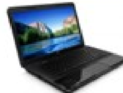
One Free Laptop per Child