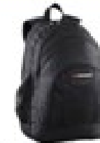
Free School Bags